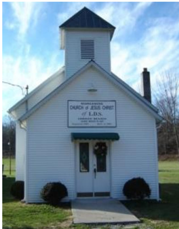
The oldest Reorganized Church of Latter Day Saints in Ohio is located in Limerick