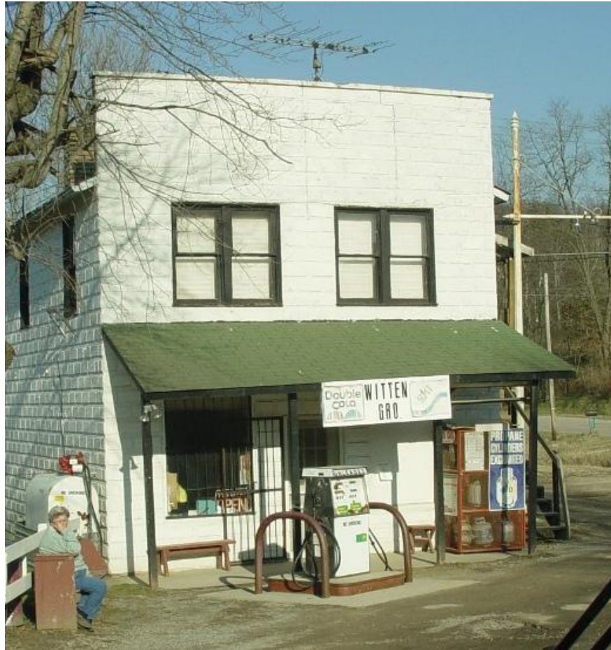
The Witten Grocery