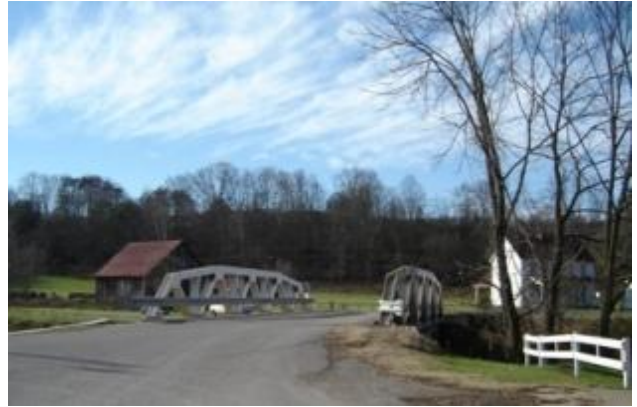
Bridge at Limerick