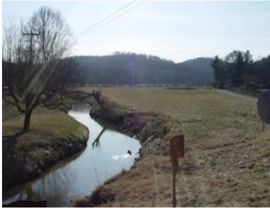
Pigeon Creek beside Limerick Road